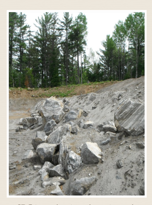
SRC is a volcanic carbonatite rock found in the Sudbury region in Northern Ontario, Canada.

SRC was formed when magma intruded into the overlying bedrock of the area over 2.8 billion years ago.